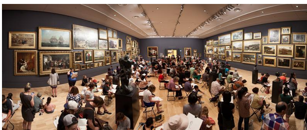
First Drop By Drawing NGV Jan 6, 2013

gleneiraartistsociety.org – phone 0402 349 131 or 0412 030 467 – email info@gleneiraartistsociety.org