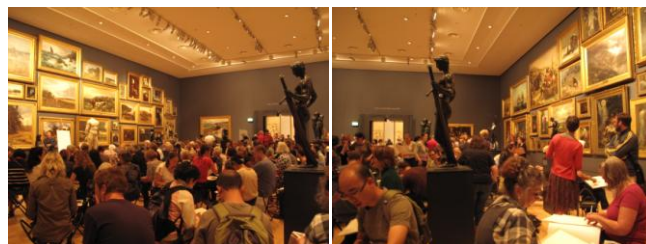
Fourth Drop By Drawing NGV Jan 27, 2013

Overnight Art For anyone with a quick hand, the frenetic 24 hr Art Blitz at the Kingston Arts' Centre Competition application closes Feb 8 or when full. There are 3 categories of visual arts and creative writing: 2D, 3D and writing based on a visual piece. http://www.kingstonarts.com.au/visual-arts/exhibitions/artz-blitz-2013 . Mystery topic revealed 5 pm March 1 st . Art to be delivered 5-6 pm, Saturday March 2